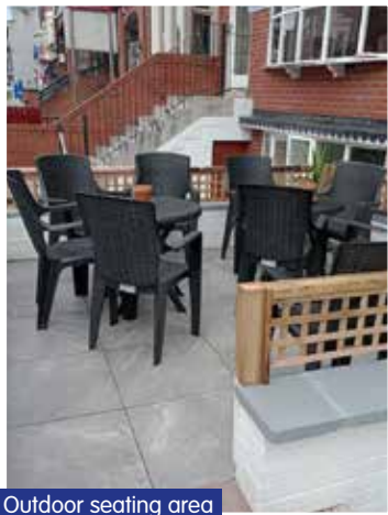
Outdoor seating area