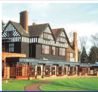
The Royal Court Hotel