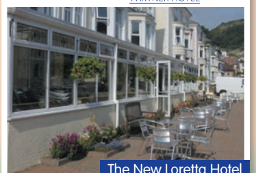
The New Loretta Hotel