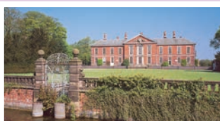
The Bosworth Hall Hotel