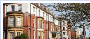
The Caledonian New Southlands Hotel