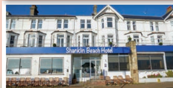
The Shanklin Beach Hotel