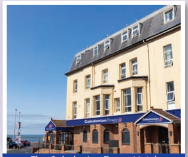
The Caledonian Tower Hotel