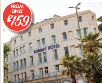
The Caledonian Torbay Hotel