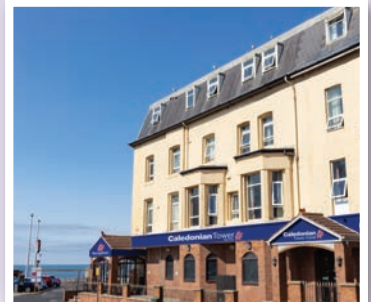
The Caledonian Tower Hotel