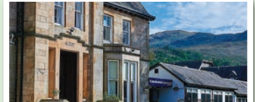
The Caledonian Claymore Hotel