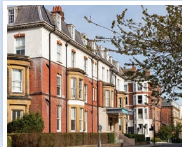
The New Southlands Hotel