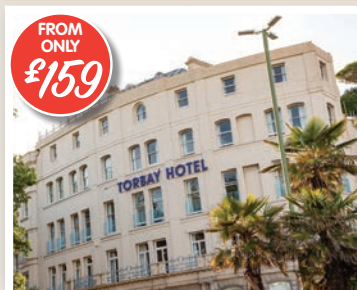
The Caledonian Torbay Hotel