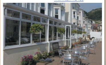
The New Loretta Hotel