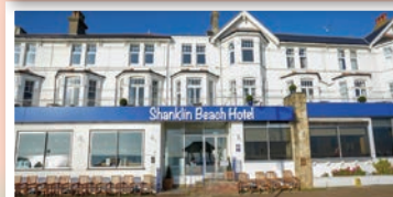
The Shanklin Beach Hotel